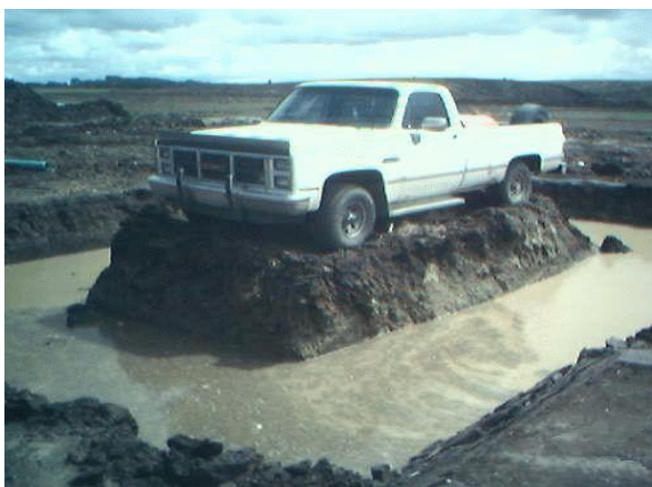
Never upset the guy driving the backhoe.