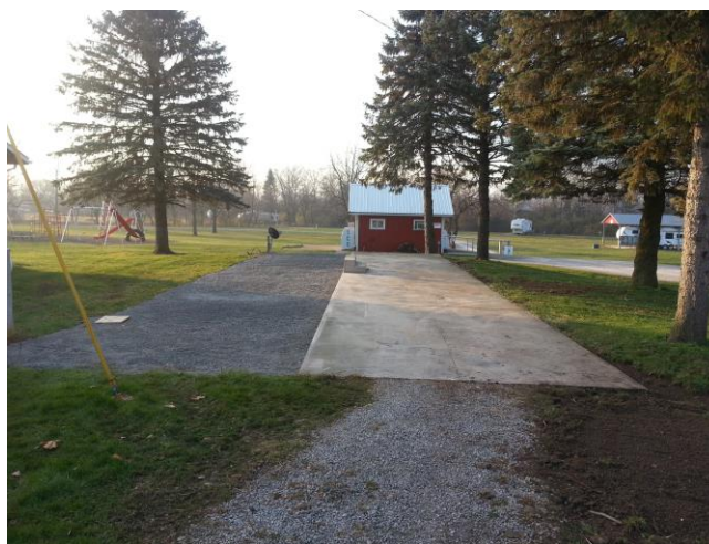
Step Four- Refashion lot for VIP in 2013.