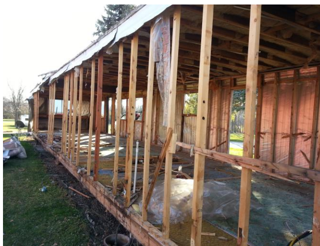
Step Two- Gut and remove back wall from mobile home.