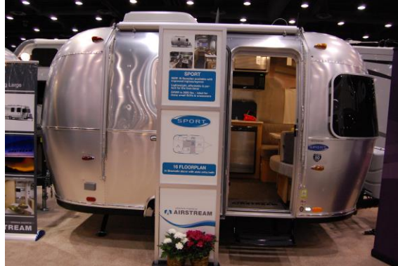
The smallest Airstream travel trailer available, Price- $42,000

I was also able to meet all of our Coachmen representatives. Each one of them greeted me like I was family and were very interested in how things were going at Poor