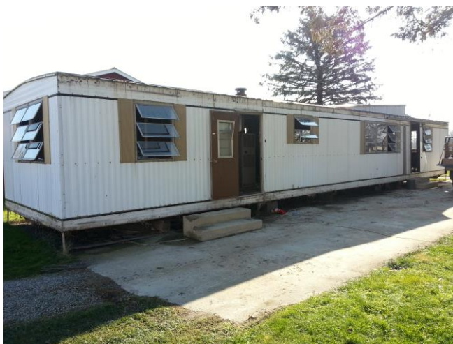
Step One- Remove awning and skirting from mobile home.