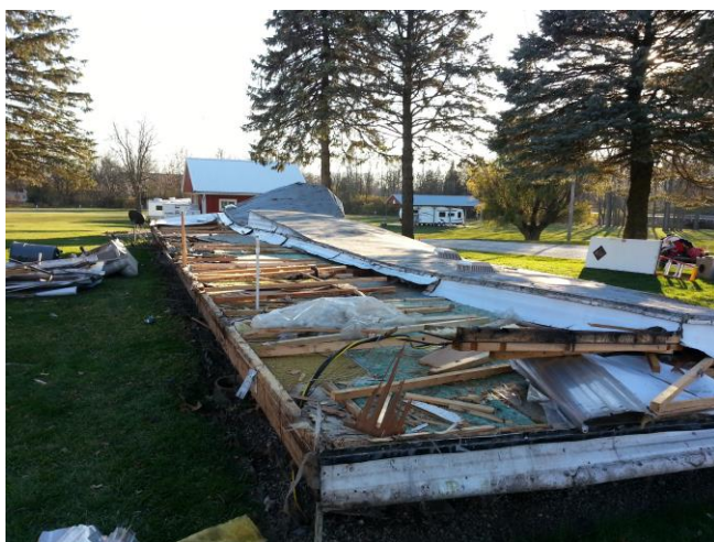
Step Three- Bringing down the house! See our Facebook page to see this step.