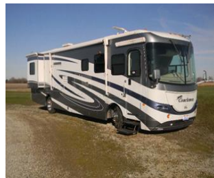
Poor Farmer's RV

the rear living area give this coach more room than you know what to do with. It comes with an electric awning, electric front jacks, and a pop-up flat screen TV for those that want to put the world away for a bit.