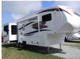
Poor Farmer's RV