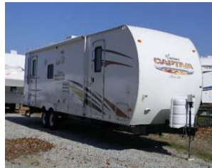
Poor Farmer's RV

"...a great addition to anyone's retirement plan or just a great way to "one-up" your buddies".